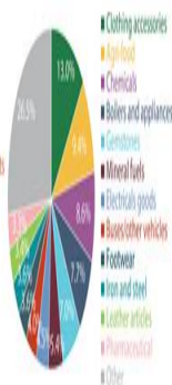
Indian exports to EU (2015)

EPJ European Parliamentary Research Service